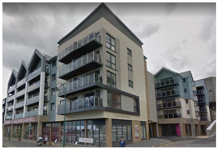
Mounts Bay Retail Centre - Completed 2018